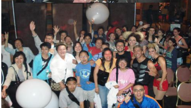
Special Olympians with AntiGravity Cast