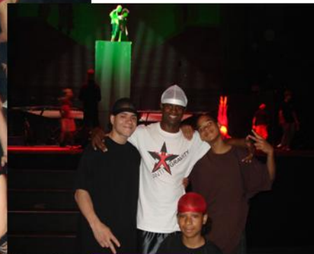
World Champion Tumbler Rayshine Harris with NYC young subway performers

Hundreds of NYC kids were treated to a spectacular gymnastics show! June 27 – July 1, 2007